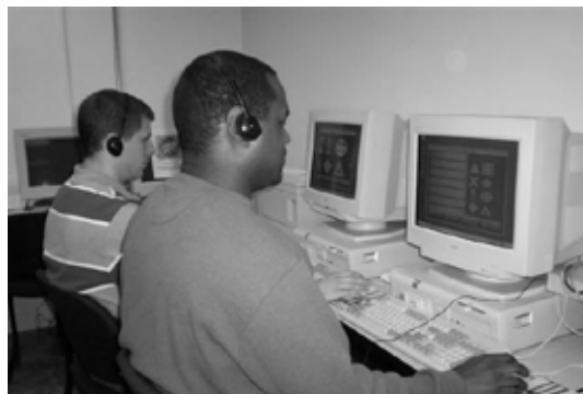
STUDENTS WORK ON MODUMATH AT THE FIRST CHOICE PRE-APPRENTICESHIP PROGRAM IN RACINE, WISCONSIN